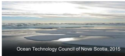
Ocean Technology Council of Nova Scotia, 2015

In the oceans technology sector, specialists in human resources help companies succeed by managing people within the organization. Specialists in human resources represent both management and employees fairly, equally, and respectfully. They deal with diverse issues such as hiring, wage structures, performance management and collective agreement negotiation, and controversial decisions such as downsizing.